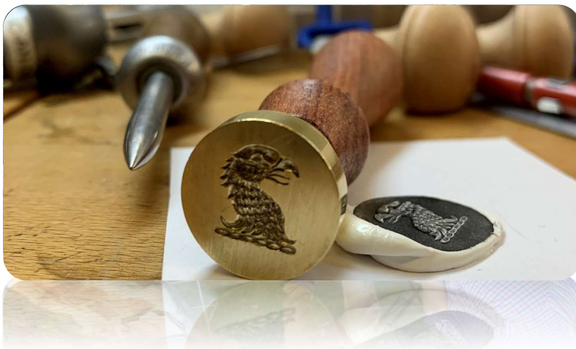
Engraved seal with eagle design from Seal Engraving Course 2022

Time commitment: about 4 Board meetings per year. Additionally, the Treasurer is also expected to have regular meetings with the Director and Administration Manager. These meetings and events usually take place in or around London and the Home Counties, but there may be the occasional requirement to travel to other parts of the country.