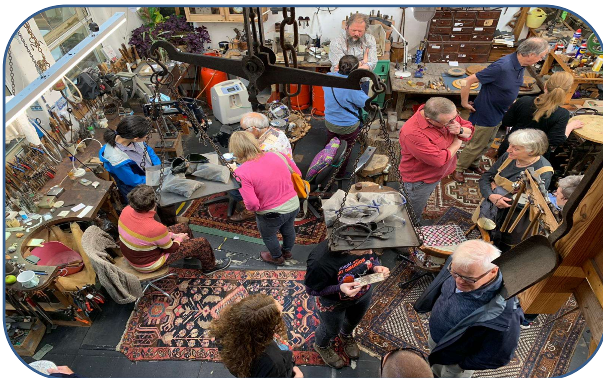
International Hand Engraving Symposium, Scotland, September 2022